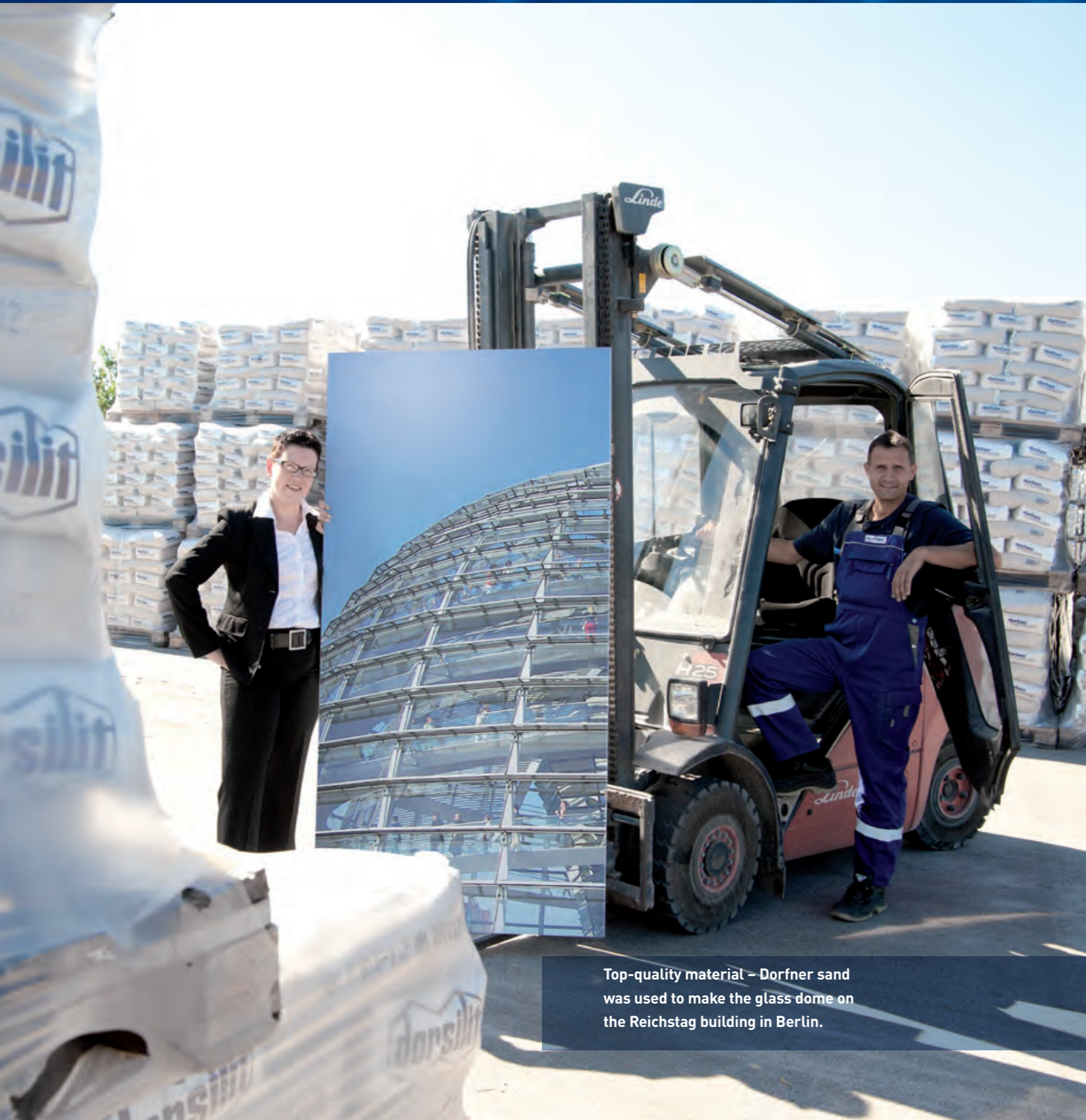
Top-quality material – Dorfner sand was used to make the glass dome on the Reichstag building in Berlin.